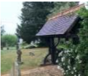
Church Roof – when under repair

War Memorial – commemorating those who gave their lives in the two world wars.