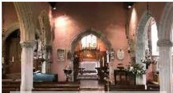
Nave, Chancel and Altar – looking East