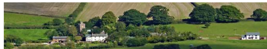
View of Cadbury Church and surrounds looking east

The Parish Church of St. Michael and All Angels is in the rural Deanery of Cadbury and the Archdeaconry of Exeter and Diocese of Exeter.